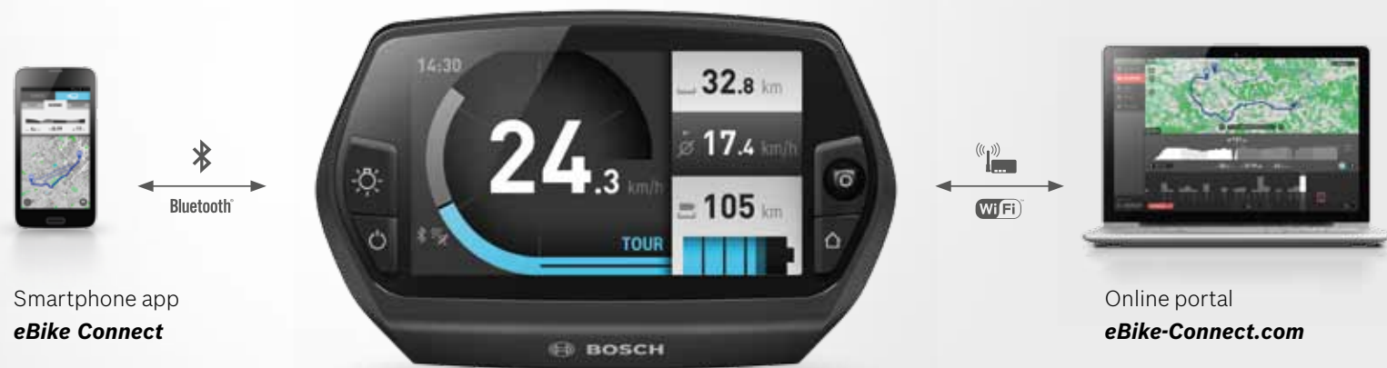
Smartphone app eBike Connect